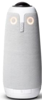
Meet our Meeting Owl Pro

If you would rather engage in an in person session please contact McAllister Cox.